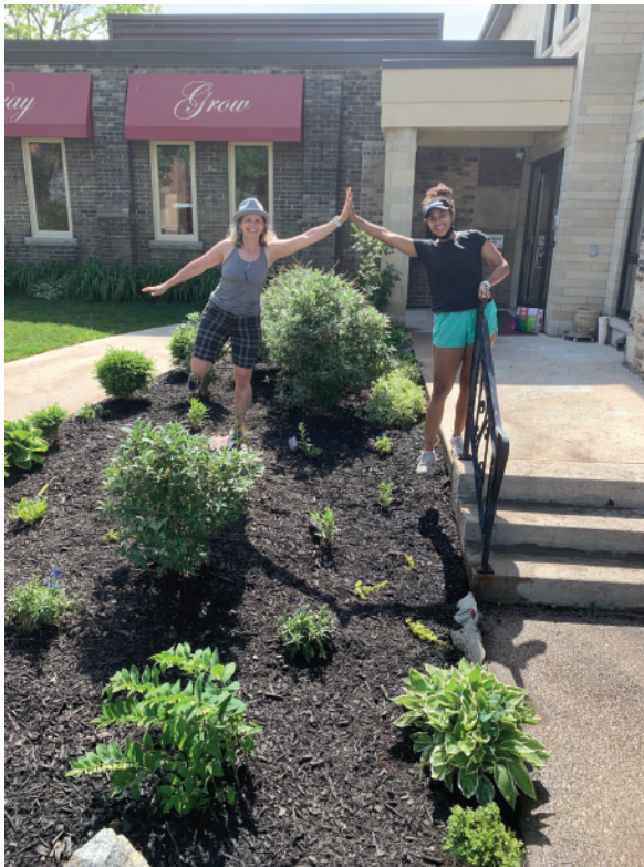
A newly planted pollinator garden at St Margaret, New Toronto.

B At the end of this week's story, Creator promises to be in faithful relationship with humanity, the earth, and all living creatures. And Creator provides a rainbow as a reminder of that promise. Although the story says that the reminder is so that Creator won't forget, what if we learned to always interpret a rainbow as a reminder for us of Creator's faithfulness? Say a prayer of thanksgiving for this beautiful sign in the sky.