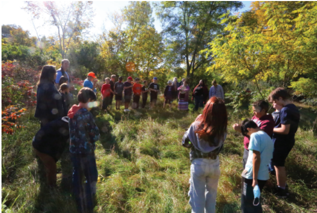
A teaching gathering at the site of the future Mishkodeh Centre for Indigenous Knowledge.

One project in the Diocese of Toronto where Indigenous and non-Indigenous people are working together is the Mishkodeh Centre for Indigenous Knowledge in Bobcaygeon. In Anishnaabemowin, Mishkodeh means meadow, a place where Indigenous people long ago created a clearing to cultivate trees and medicinal plants and to have space to gather. This project seeks to purchase the land that was formerly a mishkodeh in the heart of Bobcaygeon and create a centre for Indigenous Knowledge on this land. More information can be found at https://mishkodeh.org .