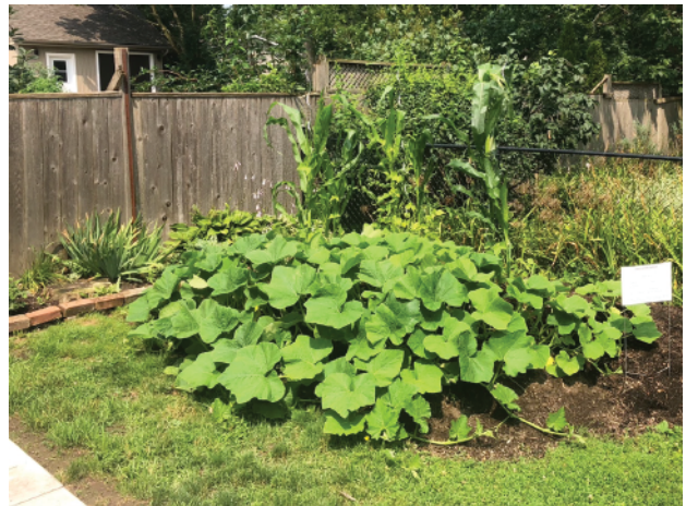
"A Vision of the Renewed Earth?" Garden Volunteers at All Saints, Whitby