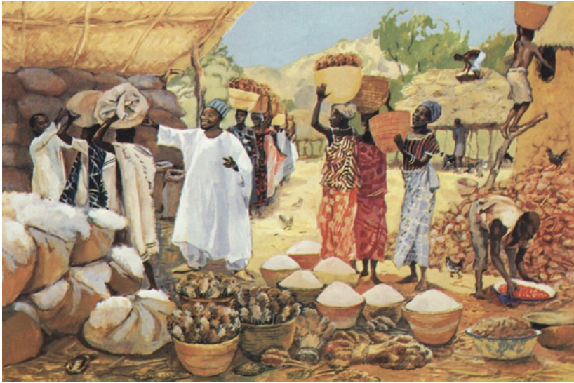
Illustration from Mafa Jesus, Cameroon

Tax Collectors were appointed by the Romans to collect taxes from farmers. Rather than paying with money, farmers would often pay with some of their crop. One of the chief ways that tax collectors became rich was by giving loans to those who could not pay their taxes. Instead of lending money, tax collectors would lend seed for planting and the farmer would be expected to repay the loan with seed or olive oil from their harvest (see the parable of the shrewd manager in Luke 16:1-9). However, if the harvest was poor, farmers would be unable to repay their loan, and the tax collector could take away their farm and make it his own.