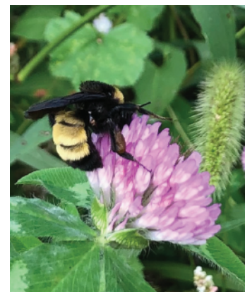
Both this American Bumble Bee and this Great Black Digger Wasp benefit from a patch of bare soil in your garden.