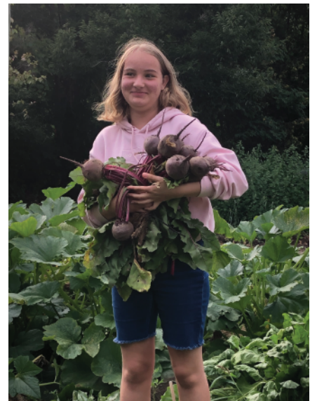
"It's all About the Beets" at St George's, Pickering Village