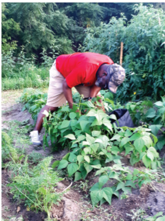
Harvesting at St George's, Pickering Village