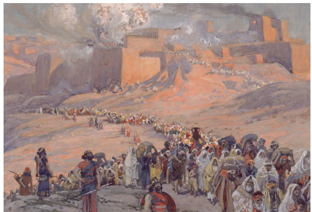
Tissot, Flight of the prisoners

The letter that Jeremiah sent to the exiles is about becoming re-placed, connected to the land where they find themselves, and learning to live faithfully with the land once again. The people who have been captured are to build themselves homes, surrounding them with gardens for food. This sounds simple, but it would mean paying attention to the soil of that place, learning what grows well there, when the rainy and dry seasons are and how to plant in their rhythm. It would mean learning about what animals and birds are likely to want to eat their food, and how to repel them or feed them something else, and what insects are beneficial. In short, the letter tells the people to become at home in their place, to become connected to this new place where they find themselves. When they build a relationship with creation in this new place, the community will be able to grow and flourish.