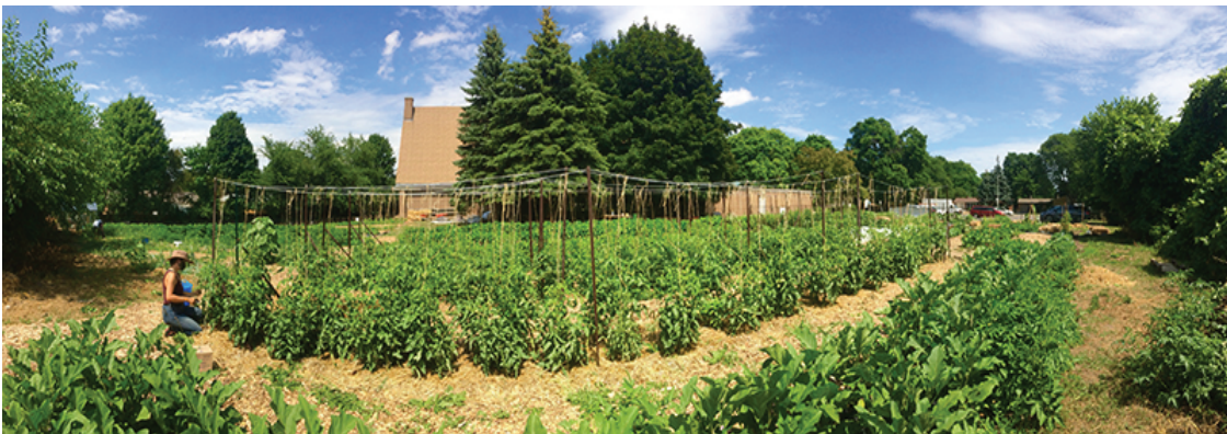
The Common Table Urban Farm at the Church of Our Saviour, Don Mills, is a project of Flemingdon Park Ministry, which works with refugees and newcomers in the community.